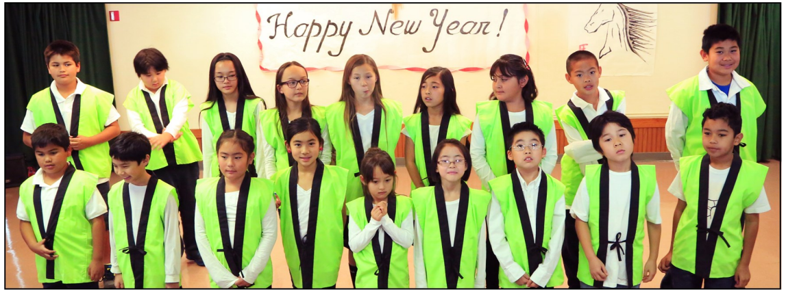
The students of the JA CL Suzume no Gakkou Summer Camp performed Japanese songs taught at the camp.