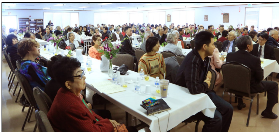
Over 200 people attended the luncheon.