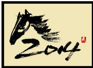
"Year of the Horse"