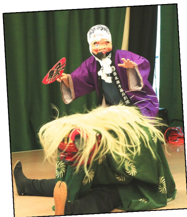
L.A. Matsuri Taiko performed the Lion Dance.