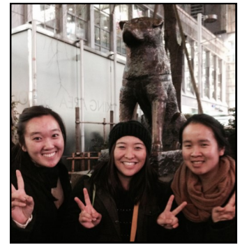
Statue of Hachiko