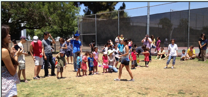
Watch your children race for their prizes.