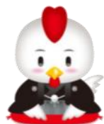
"Year of the Rooster"