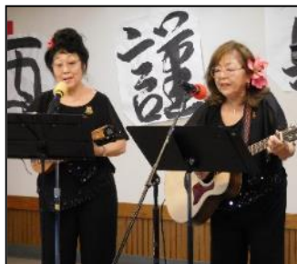
Jan & Co