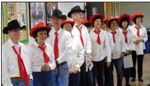
Meiji Line Dancers