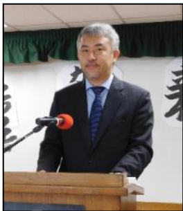
Consul Yamato Kobayashi