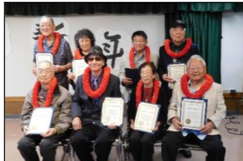
85 Years Young Members