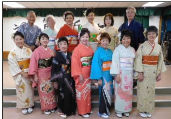
Meiji Ondo Group