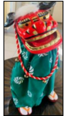
Lion Dance pushes back evil spirits; brings good luck.