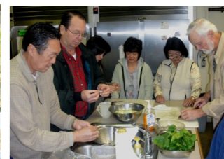
Cleaning shrimp for Sushi Hand rolls