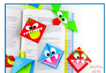
Origami Corner Bookmarks

https://www.easypeasyandfun.com/easy-origami-for-kids/