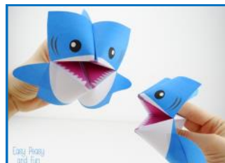
Shark Cootie Catcher

https://www.easypeasyandfun.com/easy-origami-for-kids/