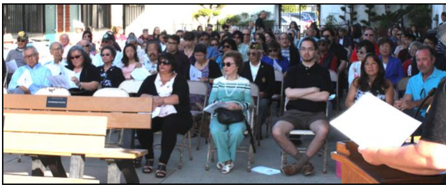
About 125 people came to honor the deceased veterans.