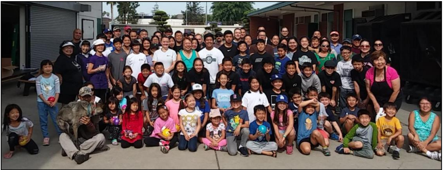
Some of the CC Clean Up Day Volunteers