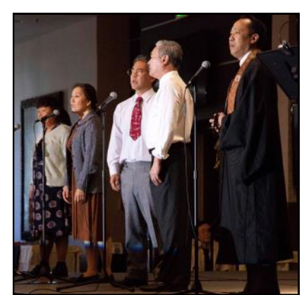
Grateful Crane Ensemble

and Reverend Kodama. The GCE knew that they had a room full of descendants and didn't want to disappoint but seemed surprised with the roaring standing ovation and bouquet of red roses.