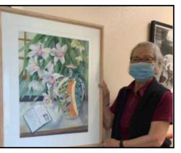
Satoko Y. " Kutaniyaki Vase and Cymbidium Flowers " with watercolor painting