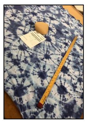
Thank You For Your Support!