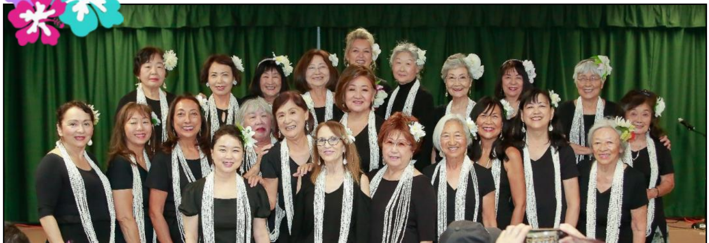
OHANA NĀ PU'UWAI NANI