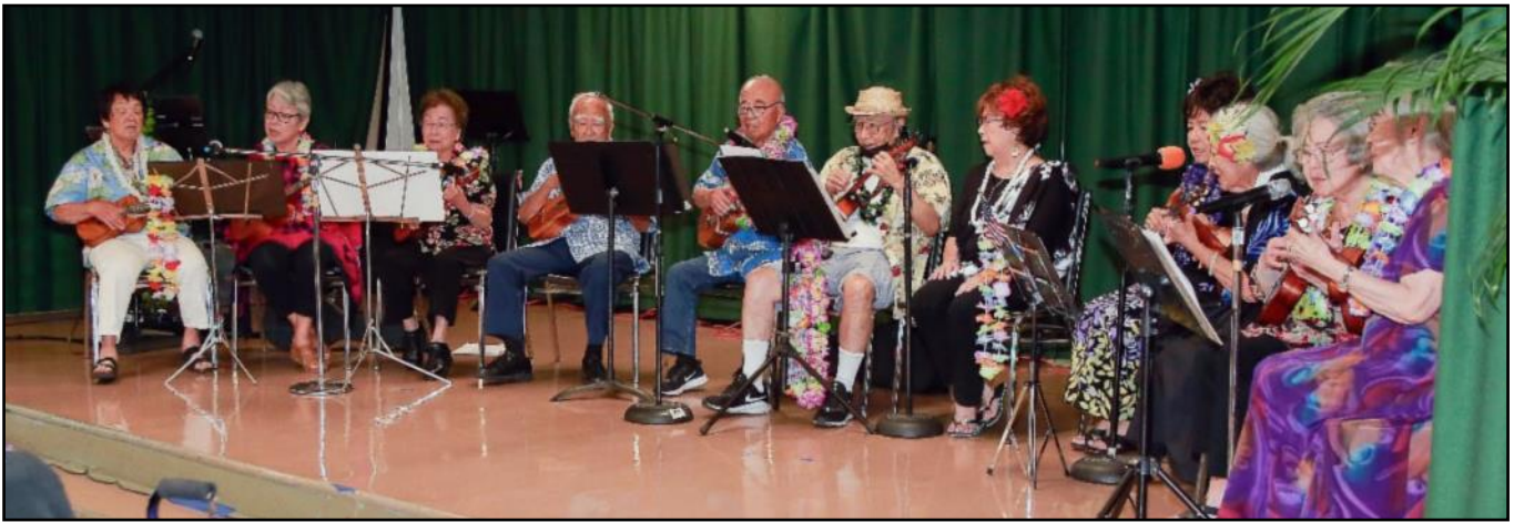
The SFVJACC's own Ukulele club hit the stage while guests ate their dinner.