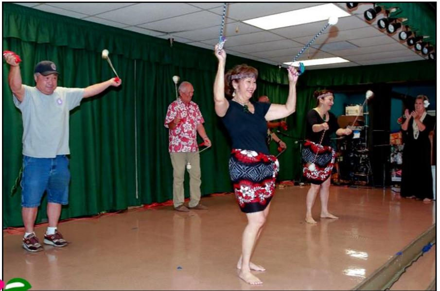
People from the audience were called to participate in this dance.