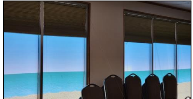
Sakaguchi Hall was transformed into a beach front.